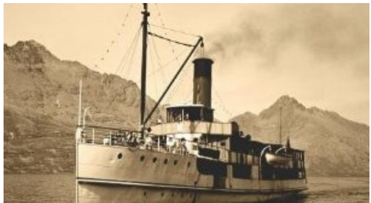
The steamer Quaker City, from the cover of a recent edition of Twain's book The Innocents Abroad (1869). The steamer was used as a Union Navy blockade runner during the Civil War, and later retrofitted for luxury cruises.