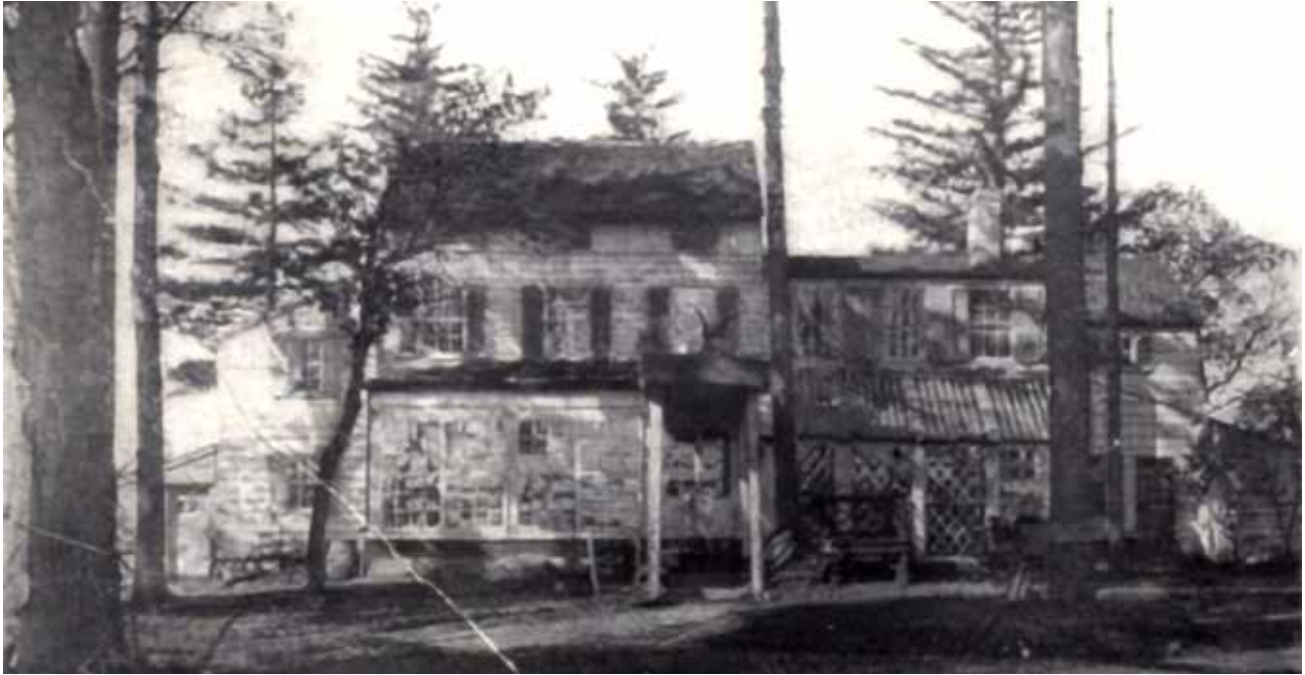
Cutter's 20-room house in Little Neck was nicknamed "Curiosity Castle" and contained rooms arranged thematically, including "The Room of Wild Beasts" (stuffed animal heads); the "War Room" (Revolutionary War mementoes); and "The Jewel Room" (precious stones).

Preserving and protecting the historical significance of Douglaston and Little Neck and adjacent nature preserves.