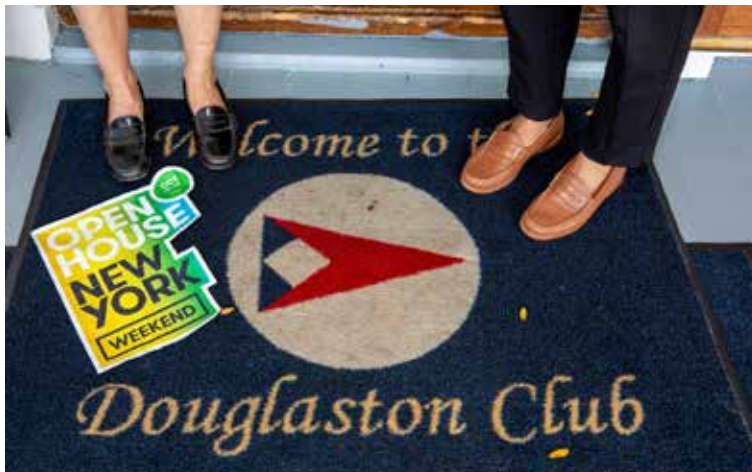
DLNHS volunteers placed the OHNY sticker at the front door of the Club to identify where to gather for guests.

On October 16, 2021, a very successful Open House New York event took place at the newly renovated Douglaston Club, drawing more than thirty participants from all five boroughs of the city. The DLNHS sponsored the event in collaboration with The Douglas House Trust of the Douglaston Club.