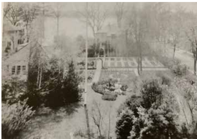
The formal rose garden at Roselawn, ca. 1920, one of the more elaborate gardens ever built in Douglas Manor. In the 1950s the garden was demolished for construction of a new house at 10 Manor Road.

When the Douglaston Garden Club was founded in 1921, it joined a movement that began in the nineteenth century, as women joined together in all kinds of associations: sewing circles, literary and musical societies, groups supporting charitable and patriotic causes, and garden clubs. In 1891, The Ladies Garden Club of Athens, Georgia, was the first garden club to form. In 1913, The Garden Club of America was founded, not long before Douglaston's own. In 1929, The National Council of State Garden Club Federations (now National Garden Clubs, Inc.) was organized with thirteen states signing on as charter members.