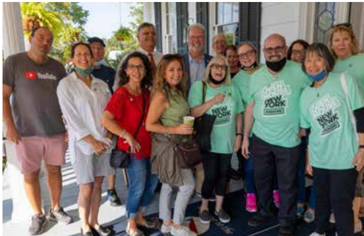
Volunteers from other OHNY events (pictured in green shirts) gathered at the Club to meet their colleagues and were treated to an impromptu private tour of the Club.